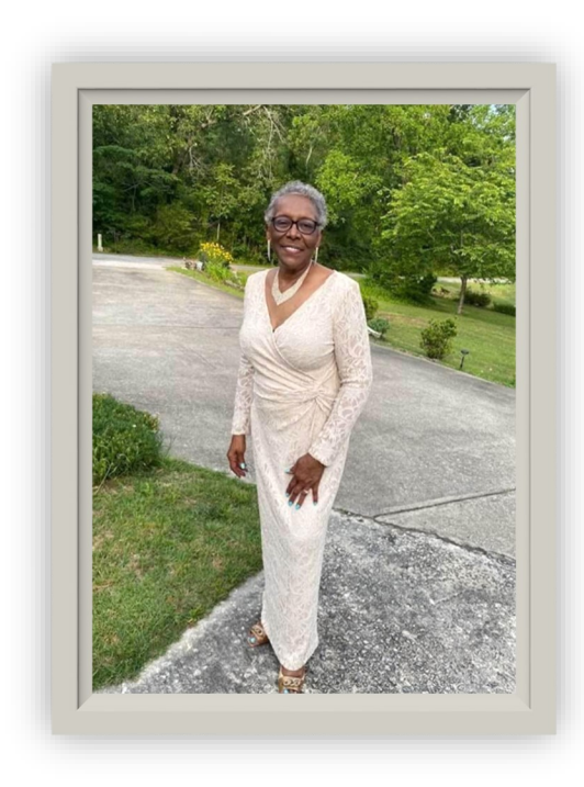
"The Broken Chain"

We little knew that morning that God was going to call your name, In life we loved you dearly; in death we do the same It broke our hearts to lose you, you did not go alone. For part of us went with you, the day God called you home You left us peaceful memories, your love is still our guide, And though we cannot see you, you are always at our side Our family chain is broken, and nothing seems the same, But as God call us one by one, the chain will link again.